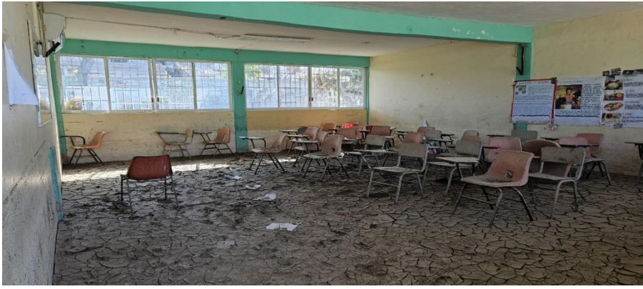
Photo: A school severely damaged after the impact of Hurricane Otis in Acapulco. UNICEF visited this and other schools to monitor the status the School and WASH infrastructure. © UNICEF México/Angélica Vergara Reporting period: 15-22 November 2023